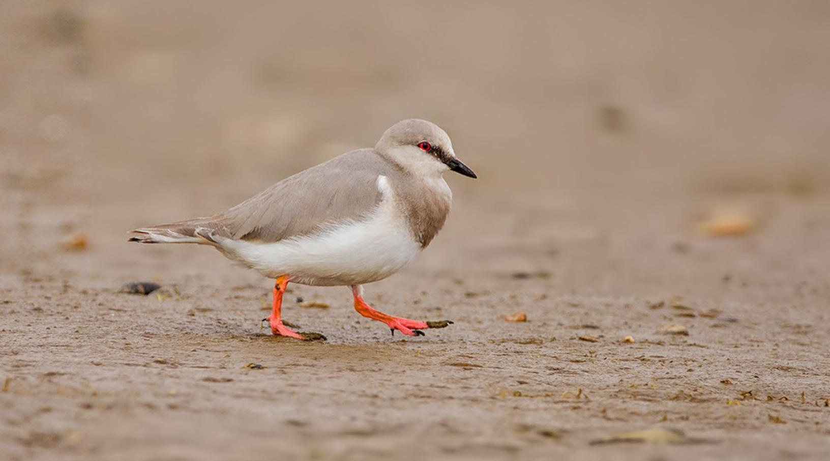
Magellanic Plover – © Andrés Terán