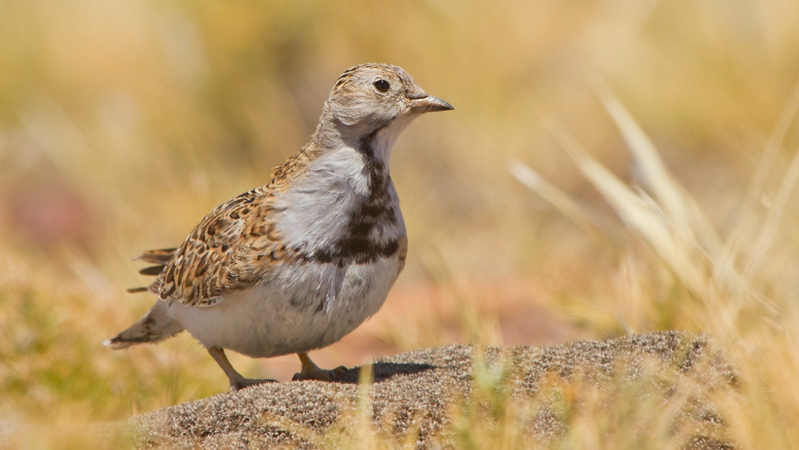
Least Seedsnipe

Other attractive species that can be found in the lagoons chosen by the Hooded Grebe are Southern Silvery Grebe, Flying Steamer-Duck, Crested Duck, Red Shoveler, Chiloe Wigeon, Chilean Flamingo, Two-banded Plover, Rufous-chested Plover and the rare Magellanic Plover , among many others. The possibilities in the Patagonian steppe of the plateau area include the scarce Patagonian Tinamou, White-throated Caracara, Least and Gray-breasted Seedsnipes, Tawny-throated Dotterel, Chocolate-vented Tyrant, Black-billed Shrike-Tyrant, Short-billed Miner, Cordilleran Canastero, Greater Yellow-Finch and many more.