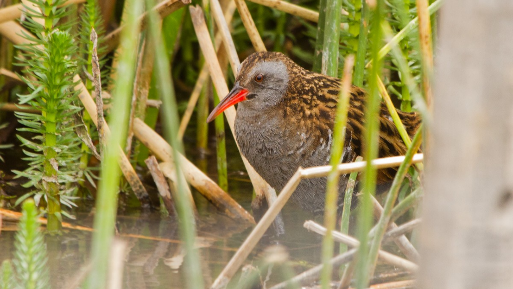
Austral Rail