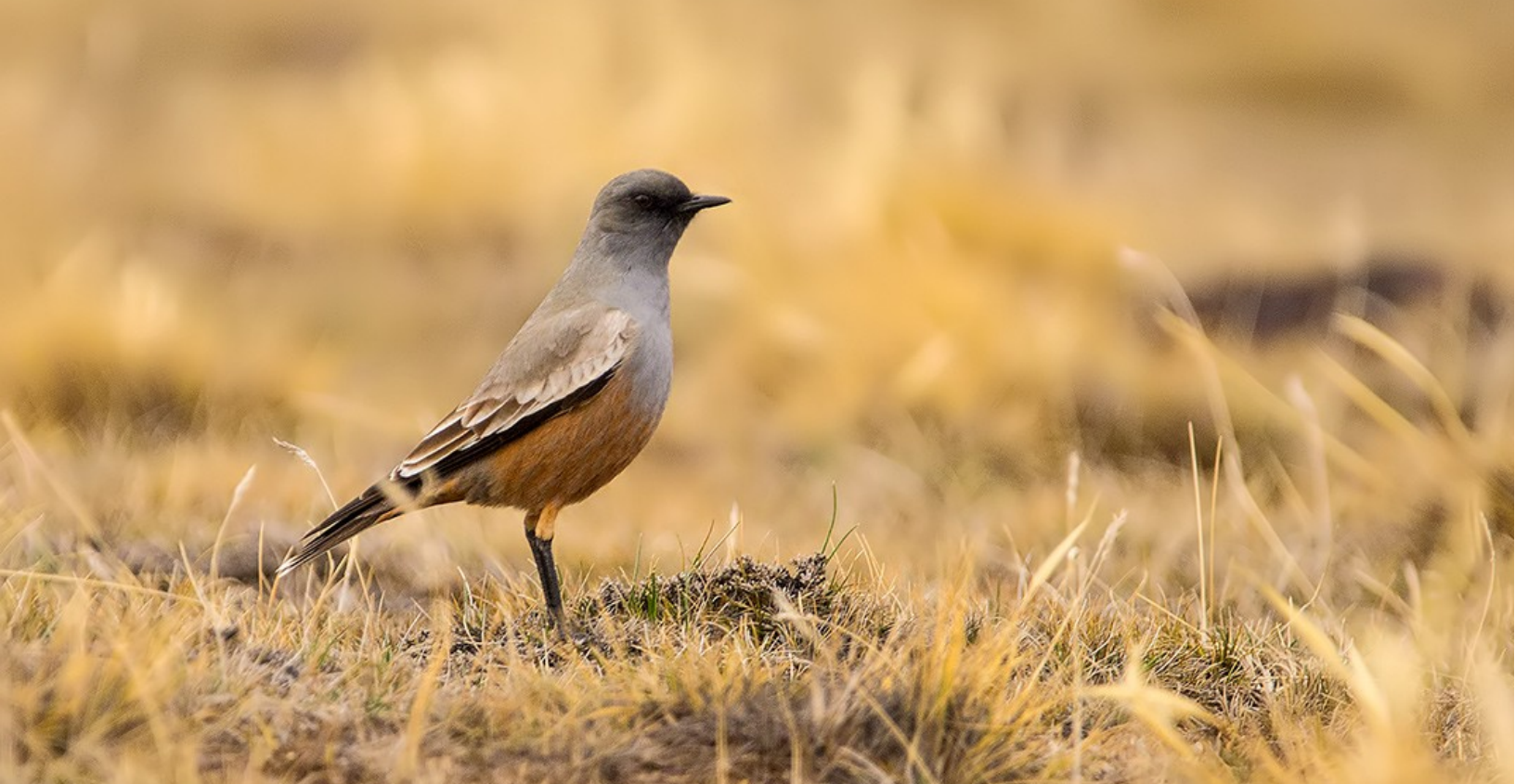
Chocolate-vented Tyrant

DAY 3: Full day birding in Strobel's plateau. Night Laguna Verde.