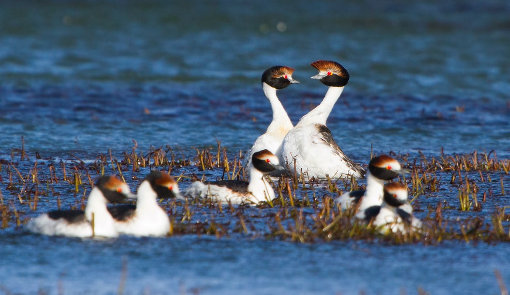
Hooded Grebes in breeding display