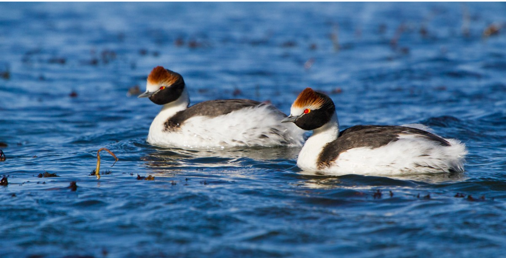
Hooded Grebes