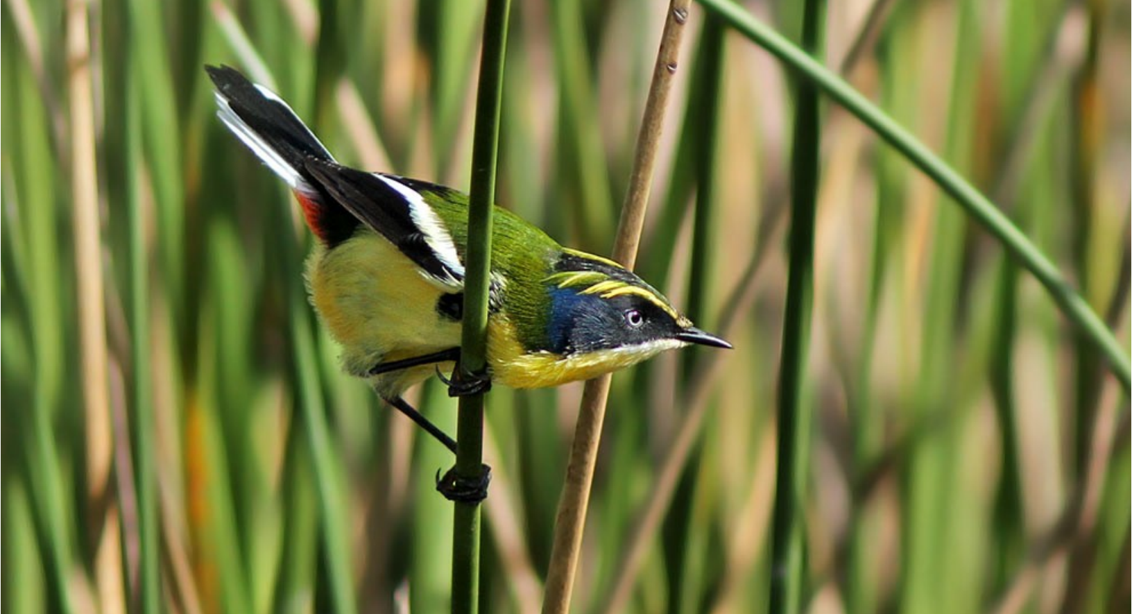
Many-colored Rush-Tyrant